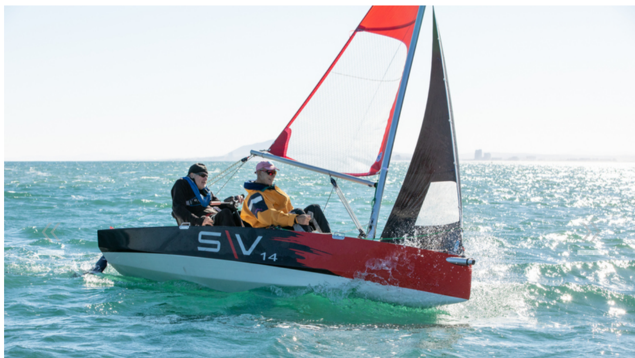
The S\V14 being put through its paces.